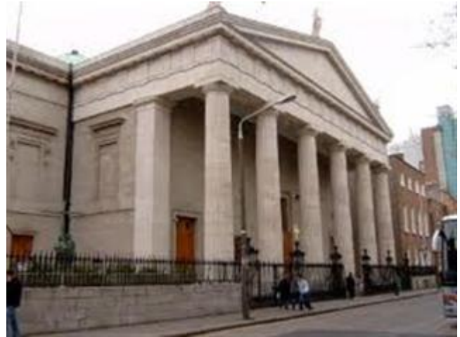
St Mary's Pro Cathedral Dublin

The other priests involved in the Peking Mission were;