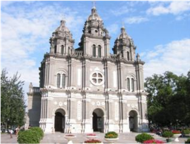
St Joseph's Cathedral Peking (Beijing) founded in 1653.