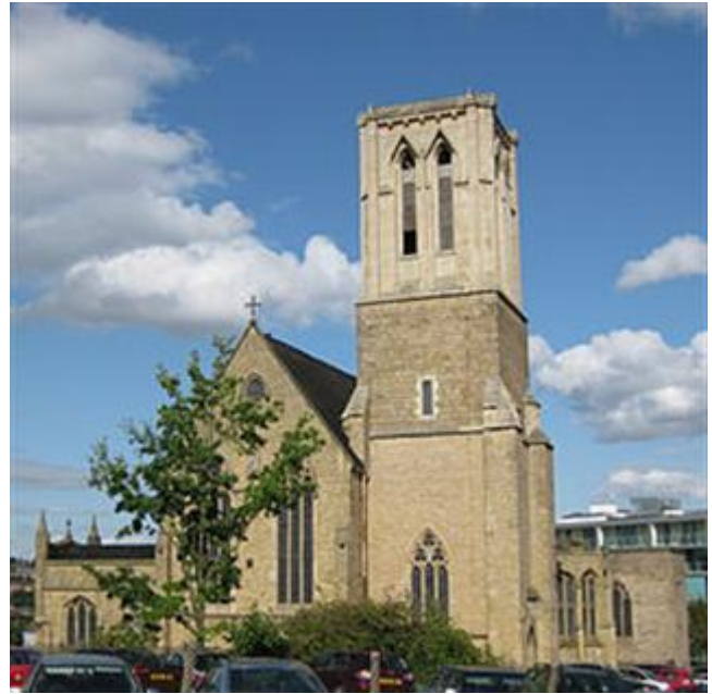
St Vincent's Sheffield