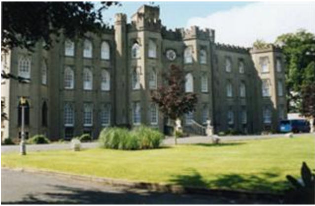
St Joseph's College, Blackrock, Dublin once a Seminary College, now a school.